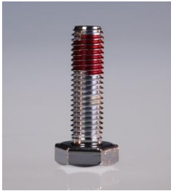
Clamp Coating for Threads